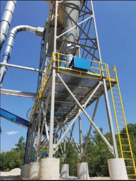
SHIP LADDERS, PLATFORMS & SAFETY RAILINGS