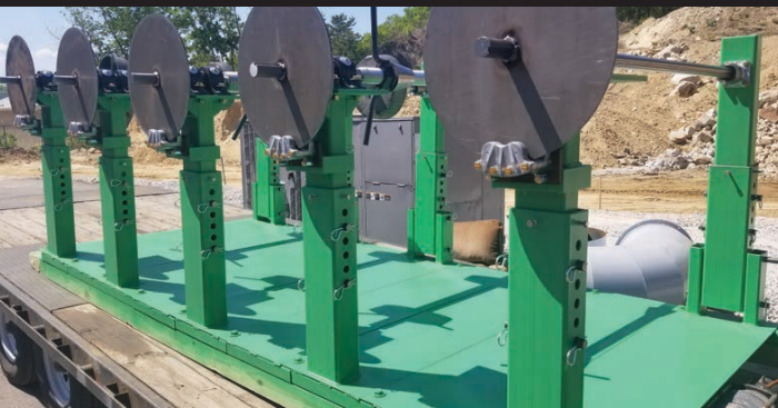
CUSTOM MACHINE DESIGN & FABRICATION