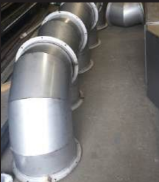
FLANGED STAINLESS PIPE