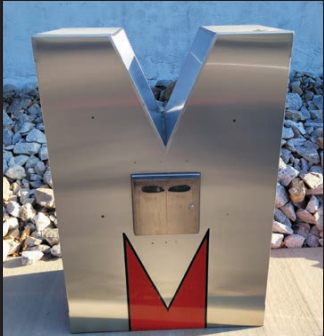
CUSTOM CAR E-CHARGERS