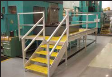
SAFETY PLATFORMS & STAIRS