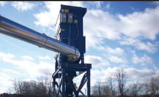
DUST, FUME & MIST COLLECTION