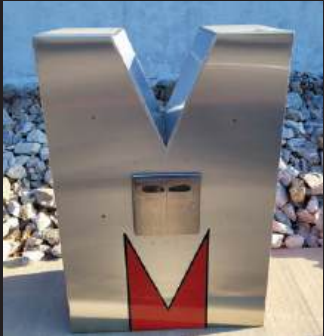
CUSTOM CAR E-CHARGERS