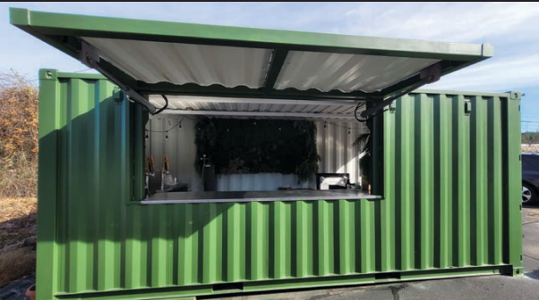
CUSTOMIZED SHIPPING CONTAINERS

603-623-5568 | www.macyind.com | Servicing All of New England