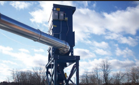
DUST, FUME & MIST COLLECTION