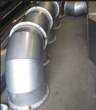
FLANGED STAINLESS PIPE