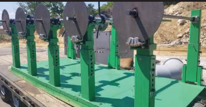
CUSTOM MACHINE DESIGN & FABRICATION