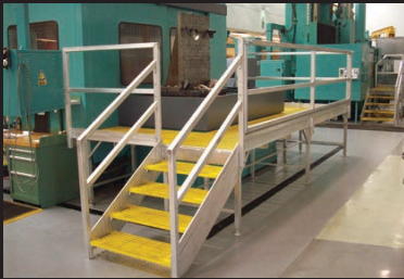
SAFETY PLATFORMS & STAIRS