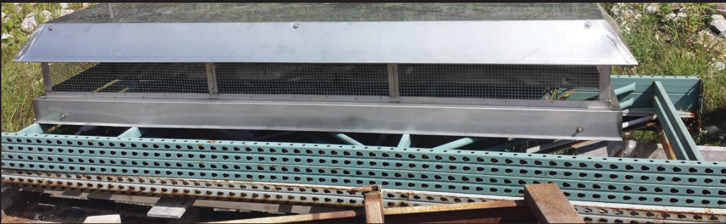
STAINLESS CHIMNEY CAP