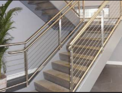
LOBBY STAIRS & RAILINGS