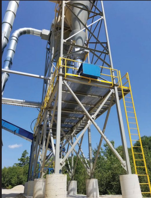
SHIP LADDERS, PLATFORMS & SAFETY RAILINGS