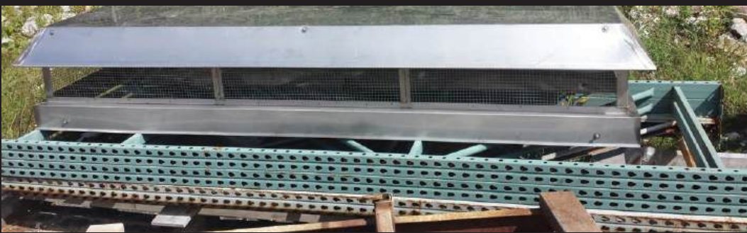
STAINLESS CHIMNEY CAP