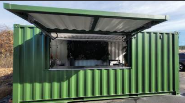
CUSTOMIZED SHIPPING CONTAINERS

603-623-5568 | www.macyind.com | Servicing All of New England