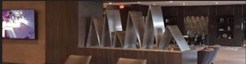
STAINLESS STEEL FIREPLACE FLAME SIMULATION