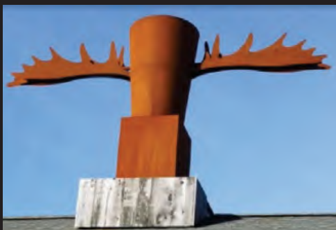
THIRSTY MOOSE TAPHOUSE